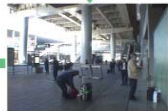
④ Limousine bus stops