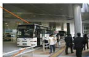
⑤ Bus stop No.5 to Awaji Yumebutai 1F of Mint Kobe