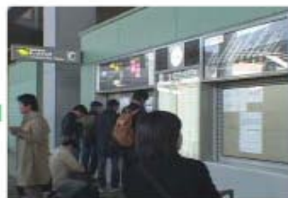
⑤ Ticket machines