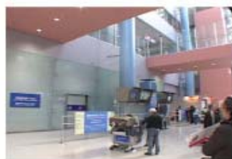
① International arrivals south exit