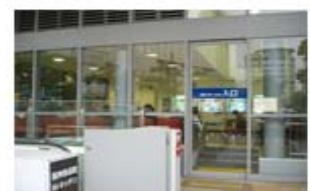
④ Waiting room on the right

3) The hotel Ebisu is within 3 minutes walk (200 meters to the south) from Ohisoko bus stop