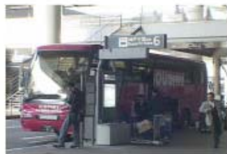
⑥ Bus stop (No. 6)