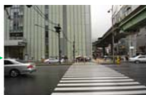
② Turn left after the crossing