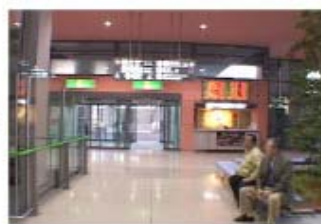
② To exit