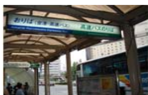
① Bus arrival from the airport